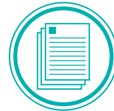
Compliance & Governance